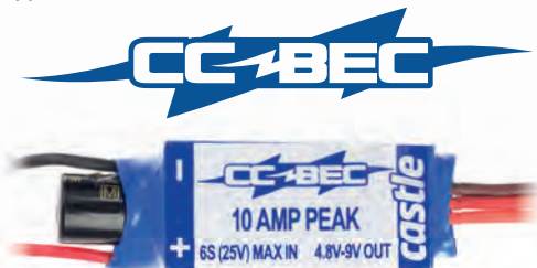
CC-010-0004-00 CC BEC 10A

Our Battery Eliminator Circuits are small devices that eliminate the need for a receiver and servo battery pack. They draw higher voltage from the motor batteries and drop it to a voltage level that is suitable for your receiver and servos. This is required in applications which draw high power for multiple servos or use more than 3S motor packs, as most ESCs with linear BECs are not designed for these applications.