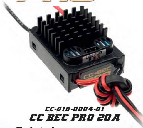
CC-010-0004-01 CC BEC PRO 20A