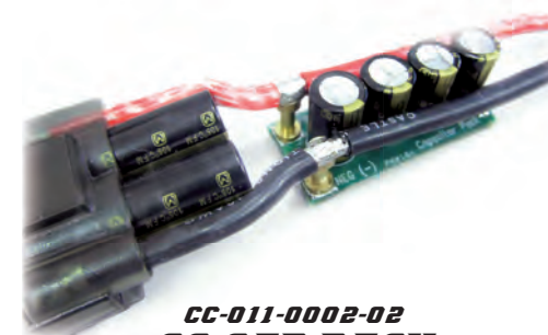
CC-011-0002-02 CC CAP PACK