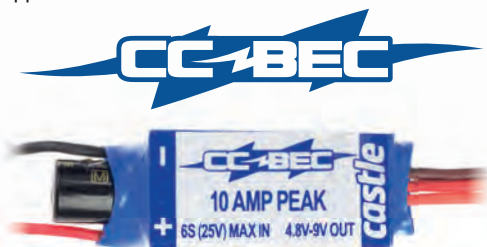
CC-010-0004-00 CC BEC 10A

Our Battery Eliminator Circuits are small devices that eliminate the need for a receiver and servo battery pack. They draw higher voltage from the motor batteries and drop it to a voltage level that is suitable for your receiver and servos. This is required in applications which draw high power for multiple servos or use more than 3S motor packs, as most ESCs with linear BECs are not designed for these applications.