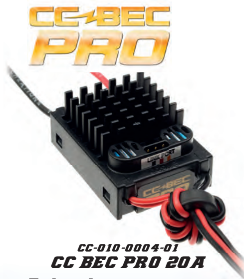
CC-010-0004-01 CC BEC PRO 20A