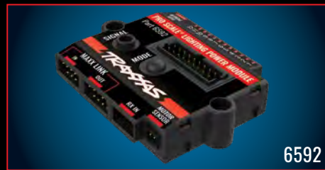
PRO SCALE LIGHTING POWER MODULE