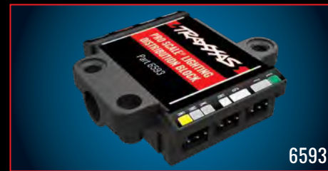
PRO SCALE LIGHTING DISTRIBUTION BLOCK